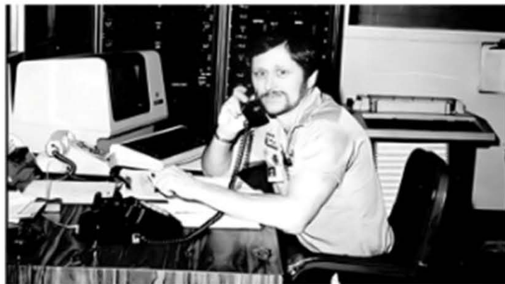
PHOTO ABOVE: 1981—The author at work in the Miami Herald pressroom.